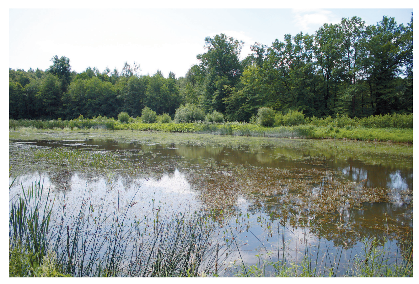
Fig. 2. Fish ponds in Moszczanica district

Koszarawa streams) and a part of Żywiec Landscape Park (Oczków district).